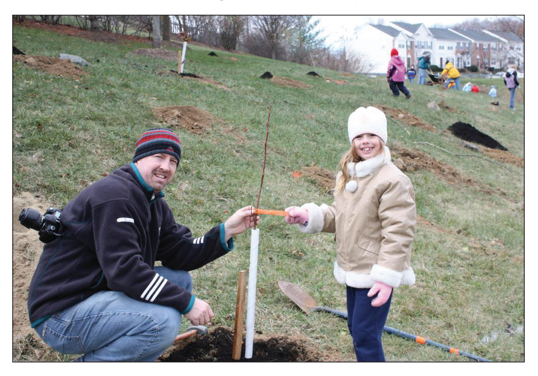
Figure 3. Increases in urban tree canopy can be achieved through programs for reforestation of public lands, such as the Town of Leesburg, Virginia's efforts to reforest dry ponds.