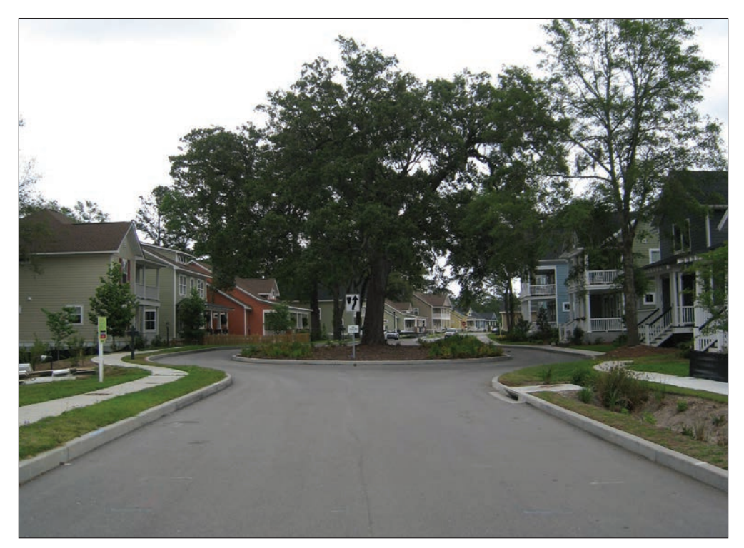
Figure 2: The Oak Terrace Preserve community in North Charleston, SC employed forest-friendly site design techniques that allowed existing mature trees to be preserved and protected.