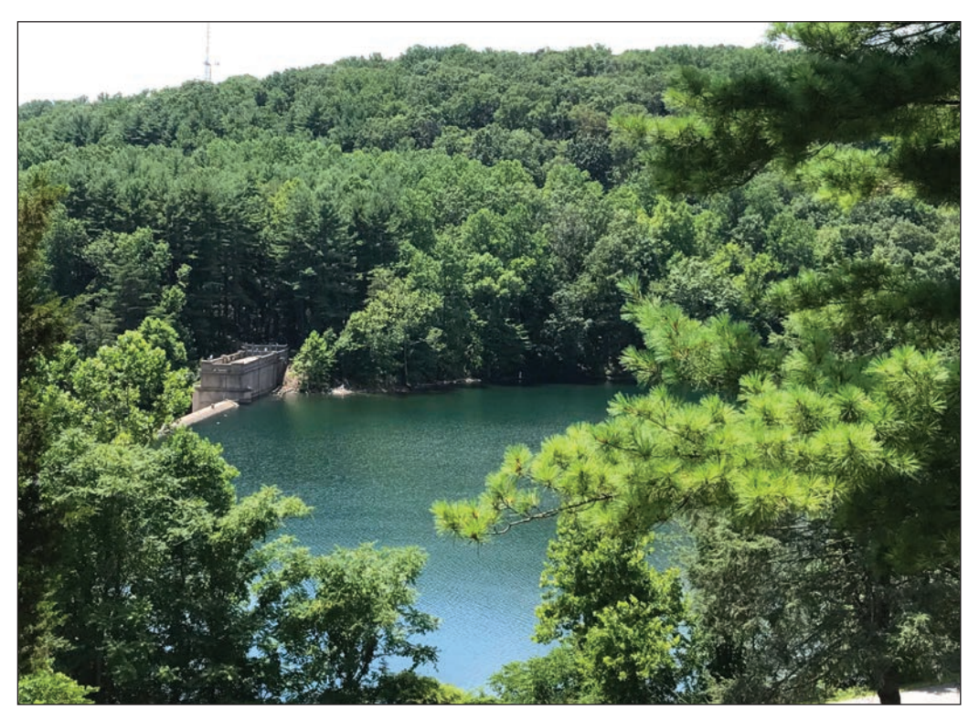
Figure 1: Land use planning and zoning in Baltimore County help to direct growth away from important forest lands such as those surrounding the County's water supply reservoirs.