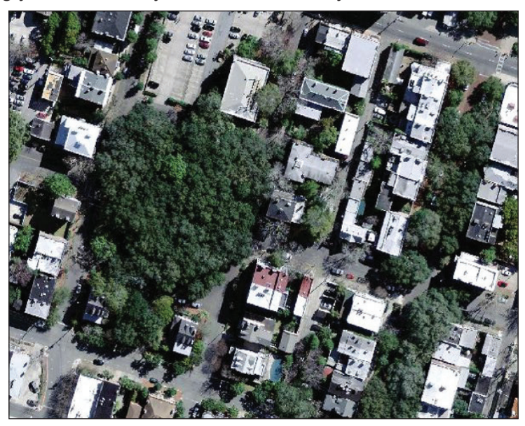
Mapping and measuring the urban tree canopy is one of the first steps in managing this important resource.

This section provides additional resources, ideas, and guidance for developing a community forestry program beyond the regulatory changes addressed in the Forest-Friendly Code and Ordinance Worksheet. The primary focus is on the Vibrant Cities Lab's Community Assessment and Goal Setting Tool, along with resources for more information to support making your community more forest-friendly.