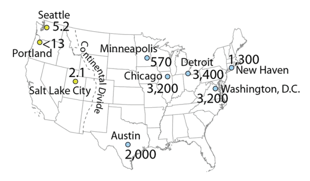
Figure 2. PAHs in dust swept from sealcoated parking lots show a striking geographic difference. PAH concentrations in dust from parking lots in central and eastern U.S. cities, where coal-tar-based sealcoat is commonly used, are about 1000 times higher than in the western U.S., where asphalt-based sealcoat is more commonly used. Concentrations are the sum of 12 PAHs ( \Sigma PAH<sub>12</sub>), in mg/kg. (Figure adapted from ref 3, Figures 1 and 2).

of PAHs in sediment exceeded Minnesota's Level 2 Soil Reference Value of 3 mg/kg benzo[a]pyrene equivalents (BaPeq), greatly increasing the cost for disposal.<sup>26</sup> Even a small amount of sealcoated pavement can be the dominant source of PAHs to sediment that collects in stormwater-management