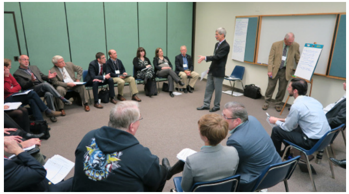
Figure 2. Participants in working sessions at Forum I.

The key challenge for bringing technology to market was described as reducing the length of time it takes to bring technology products from the laboratory to general application. A need for reliable, unbiased evaluation of emerging and competing technologies also was identified. Participants identified fragmentation in the water sector and a dysfunctional system for water technology innovation. They believed a lack of adequate investment, with investors misunderstanding the current market environment, including inadequate and inaccurate valuing of water as a commodity, to be among the top con-