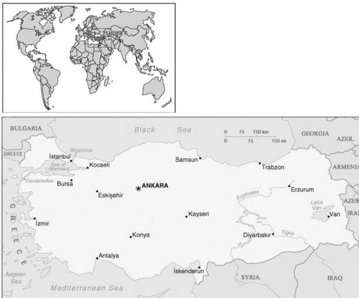
Figure 1. Turkey's position on earth ( http://www.bmtrans.com/images/tu-map.jpg ).

order to evolve suggestions that will provide guidance over and support to the road maps developed to ensure consistency of the wetlands in Turkey.